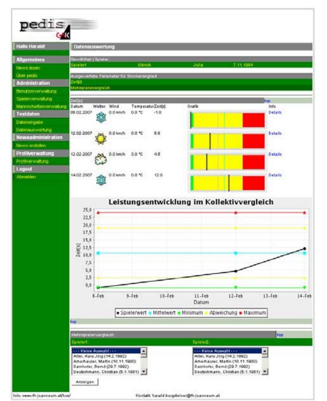
Figure 1: A screenshot giving an overview of our performance diagnosis information system. Authorized persons are allowed to analyze the data of individual subjects in direct comparison to arbitrary other players.

jump", "on-legged 5-hop", "maximum muscle power and performance", "Conconi shuttle run", "classic Conconi test including measurement of lactate and respiratory attributes" and "functional diagnostics of muscles".