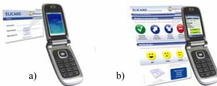
Figure 2: authentication via smartcard (a) and acquisition of subjective data by touchin iconized RFID tags (b)

A software application based on Java 2 Micro Edition (Oracle, Redwood City, CA) was developed to run on NFC enabled mobile phones. The application was developed in a generic design and was based on a configurable workflow engine to provide an individual data acquisition procedure. A graphical user interface guided the user through the data acquisition process. Data acquisition was started by touching a contactless smartcard acting as user token for identification and authentication (Figure 2 a). Entry of health parameters was done by touching NFC enabled sensor devices. In order to acquire subjective data or to run a questionnaire an icon table with RFID tags was used. For example to indicate the current well-being state or to answer a question the user only had to touch the appropriate icon (Figure 2 b). Finally data were aggregated, stored, and sent to a remote system via mobile Internet connection.